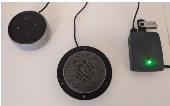
Figure 1: The setup for data collection: Conditional Voice Recorder (right) next to a Smart Speaker (left).

The Project (Un)desired observation in interaction: “Intelligent Personal Assistants” (IPA) of the Collaborative Research Center (CRC) 1187 “Media of Cooperation” at the University of Siegen aims to investigate empirically the spread of smart speakers in private homes using qualitative methods taking a perspective of media sociology and applied linguistics. In this paper, we reflect upon a technology which allowed us the data-driven linguistic analysis of smart speakers in private homes, namely the Conditional Voice Recorder (CVR, see Figure 1).